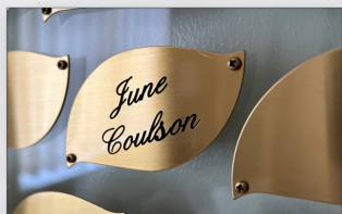
Leaves for Loved Ones

Dedicated leaves cost £150 and will be displayed on the tree for ten years after which they can be taken home for you to keep or display.